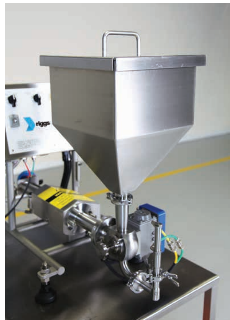
Model 1000 / Series One / Micro Fill Depositor